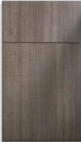
color shown: Boardwalk