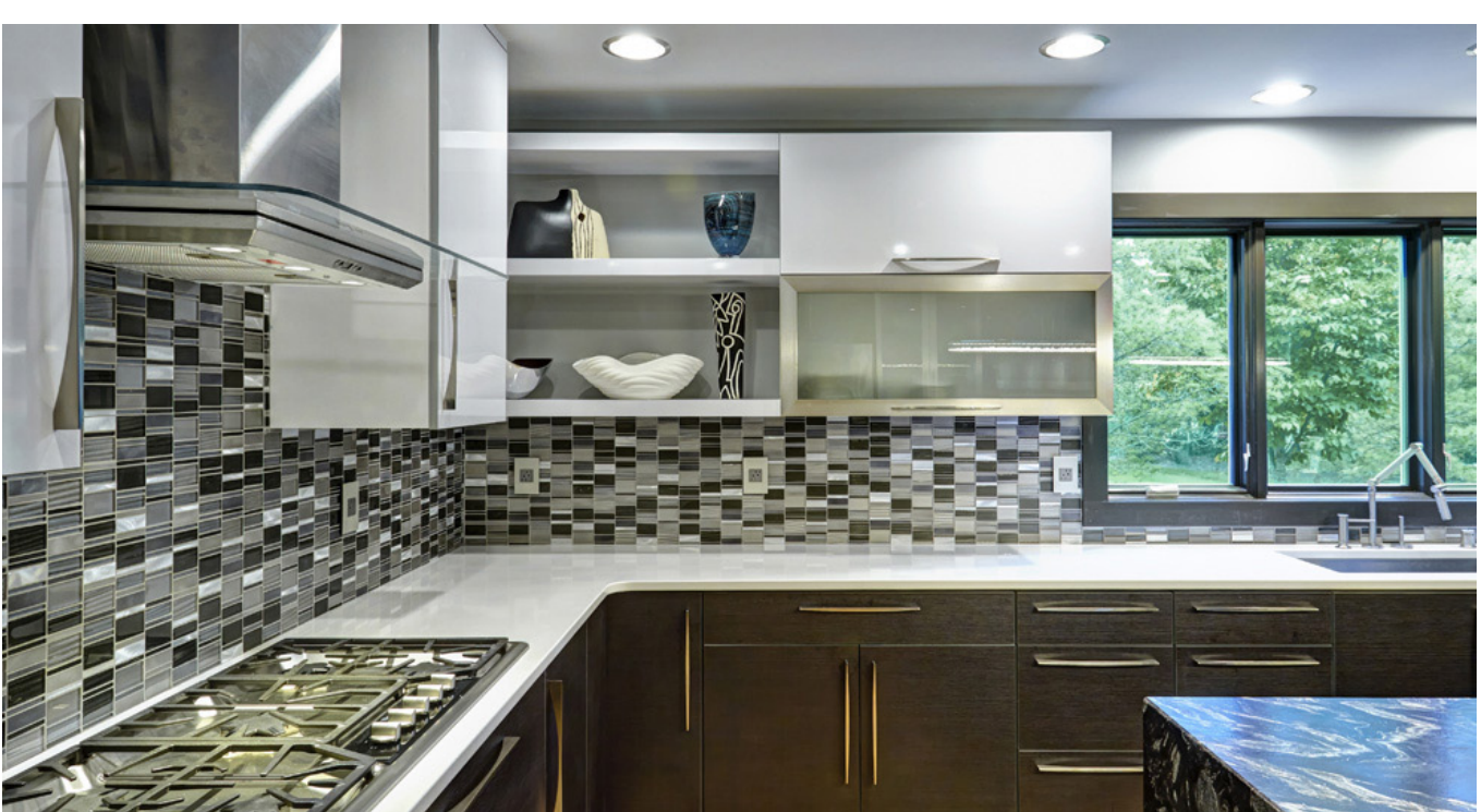
Option open wall cabinet in corner

View PDFs of our Angled Corner Cabinet and Contempo Corner Cabinet.